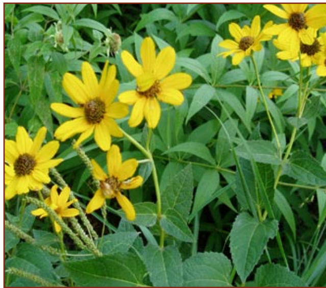
"Yellow is the color of several different native Wisconsin 'sunflowers' species and growing habitats show themselves in mid-summer profusion. The FUS native grass and wildflower area will show off most of its flowers from now until late September."

As we embark on another year together as a community of seekers, we are reminded of how important this journey is, and why we give ourselves to it. I'm looking forward to exploring it all with you!